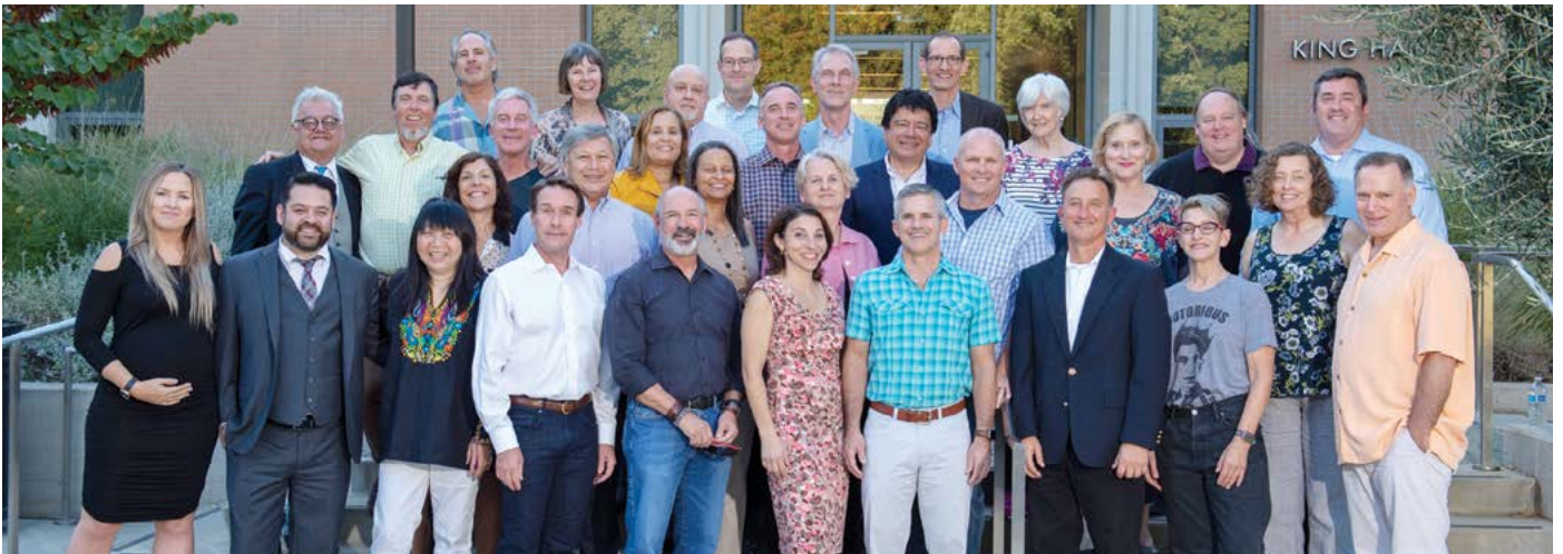
CLASS OF 1988