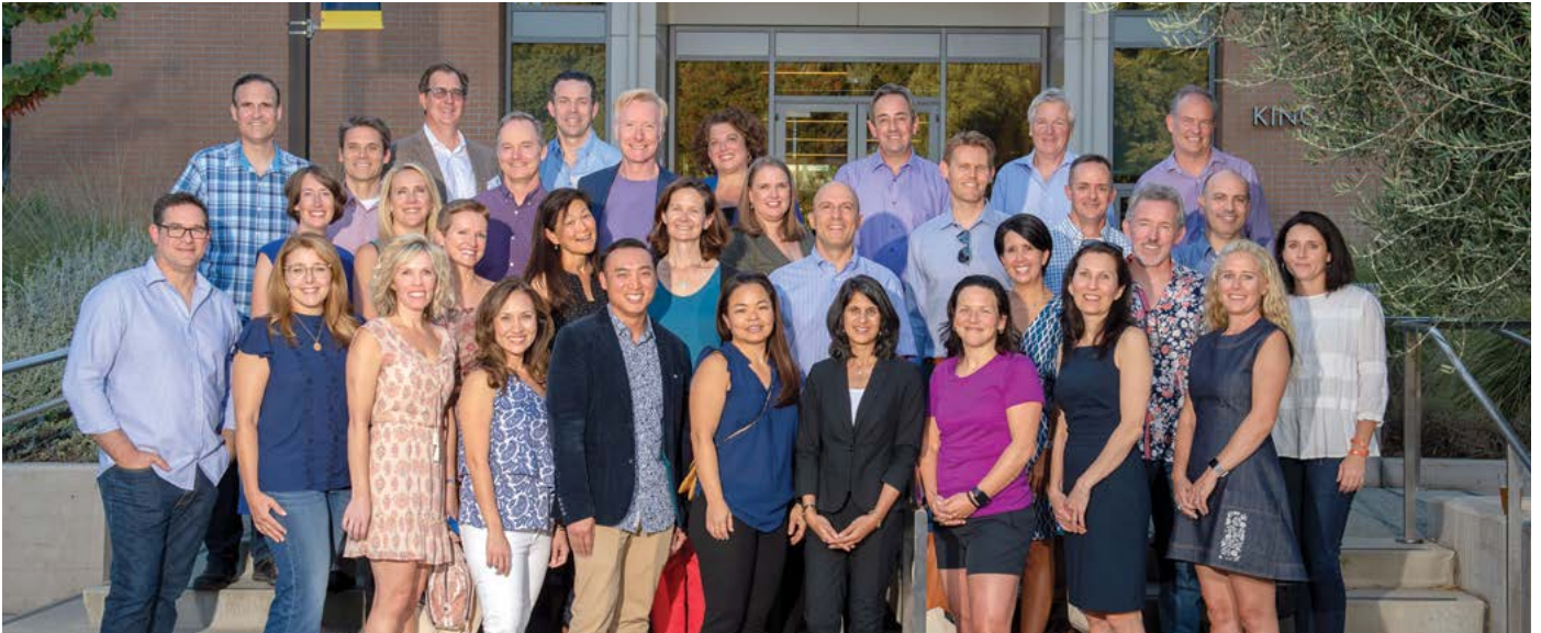
CLASS OF 1998