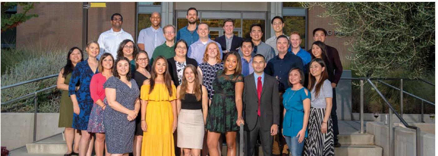
CLASS OF 2013