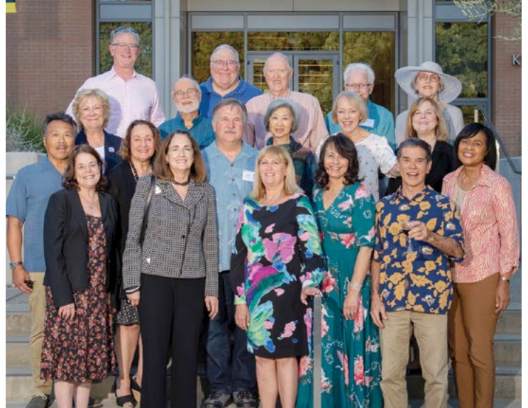
CLASS OF 1978