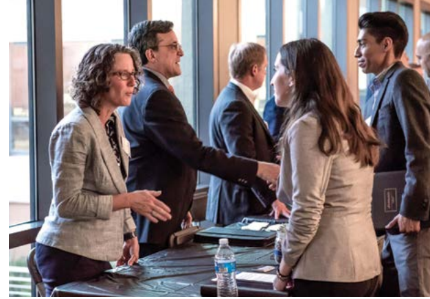
Small and Midsize Firm Fair at King Hall in October 2018

"Events like these are critical for helping UC Davis law students get hired for summer clerkships and attorney positions," she says.