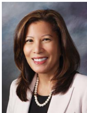
Tani G. Cantil-Sakauye '84

“I bring that same collegiality and no-competition (atmosphere) to my meetings with the justices on cases, and to policy problems and challenges in the statewide branch,” Cantil-Sakauye said. “And even when I am working as head