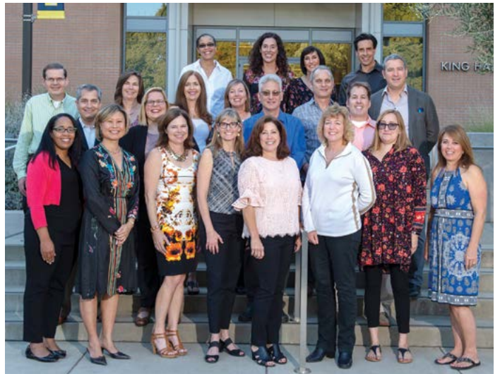
CLASS OF 1993