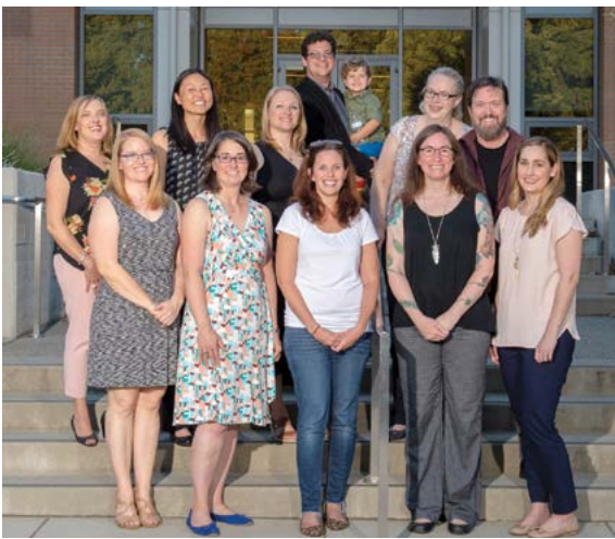
CLASS OF 2003