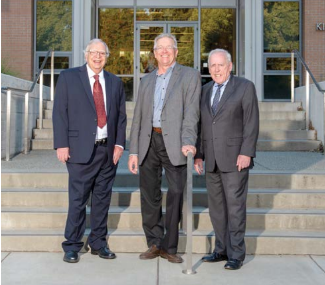
CLASS OF 1973