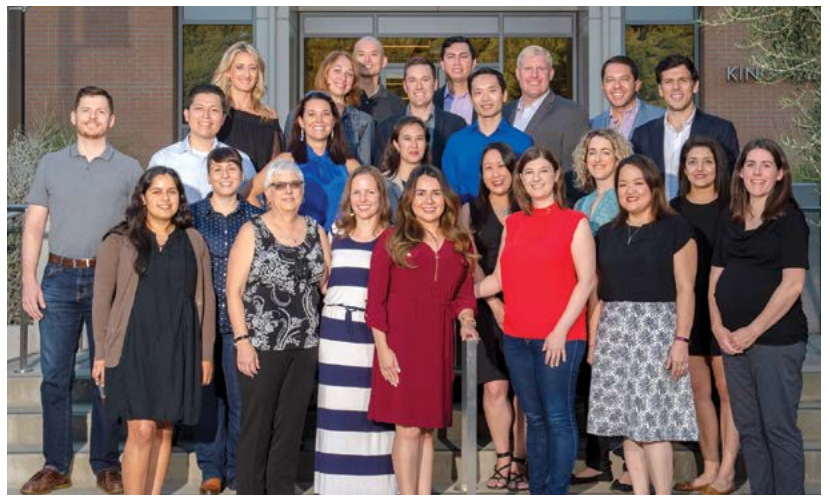
CLASS OF 2008