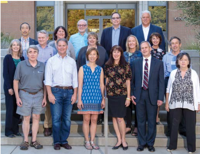
CLASS OF 1983