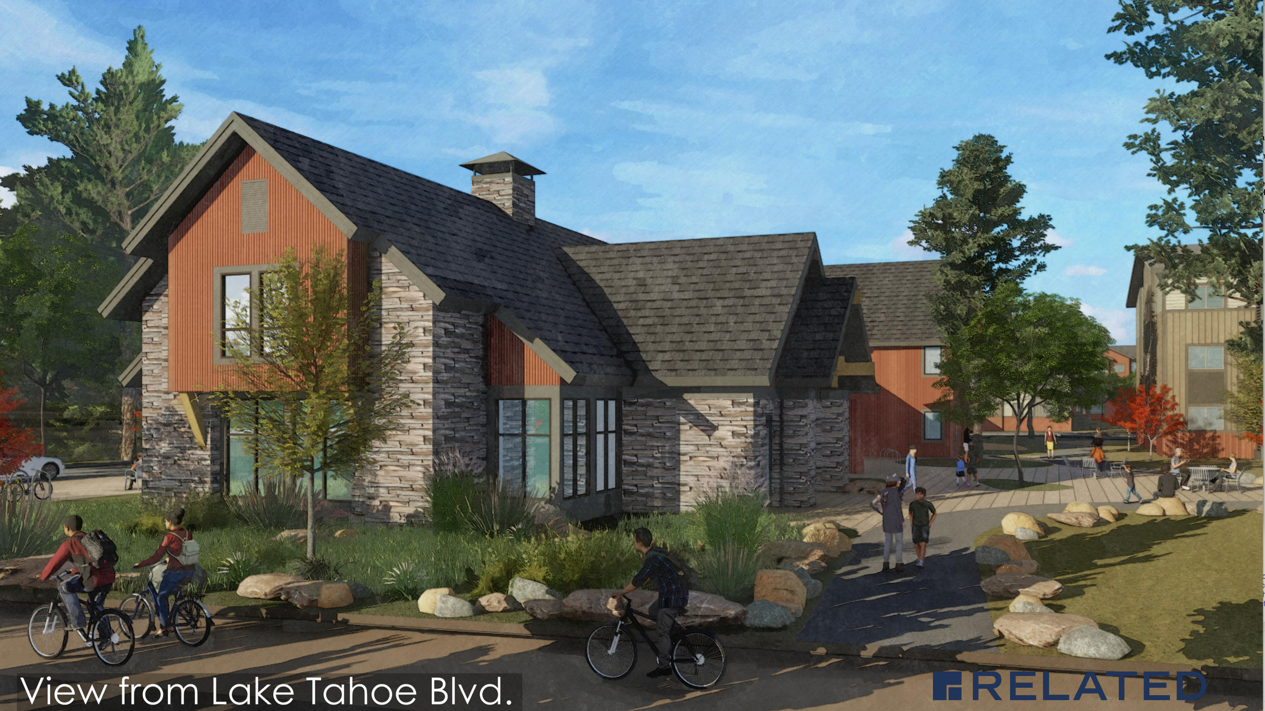
View from Lake Tahoe Blvd.