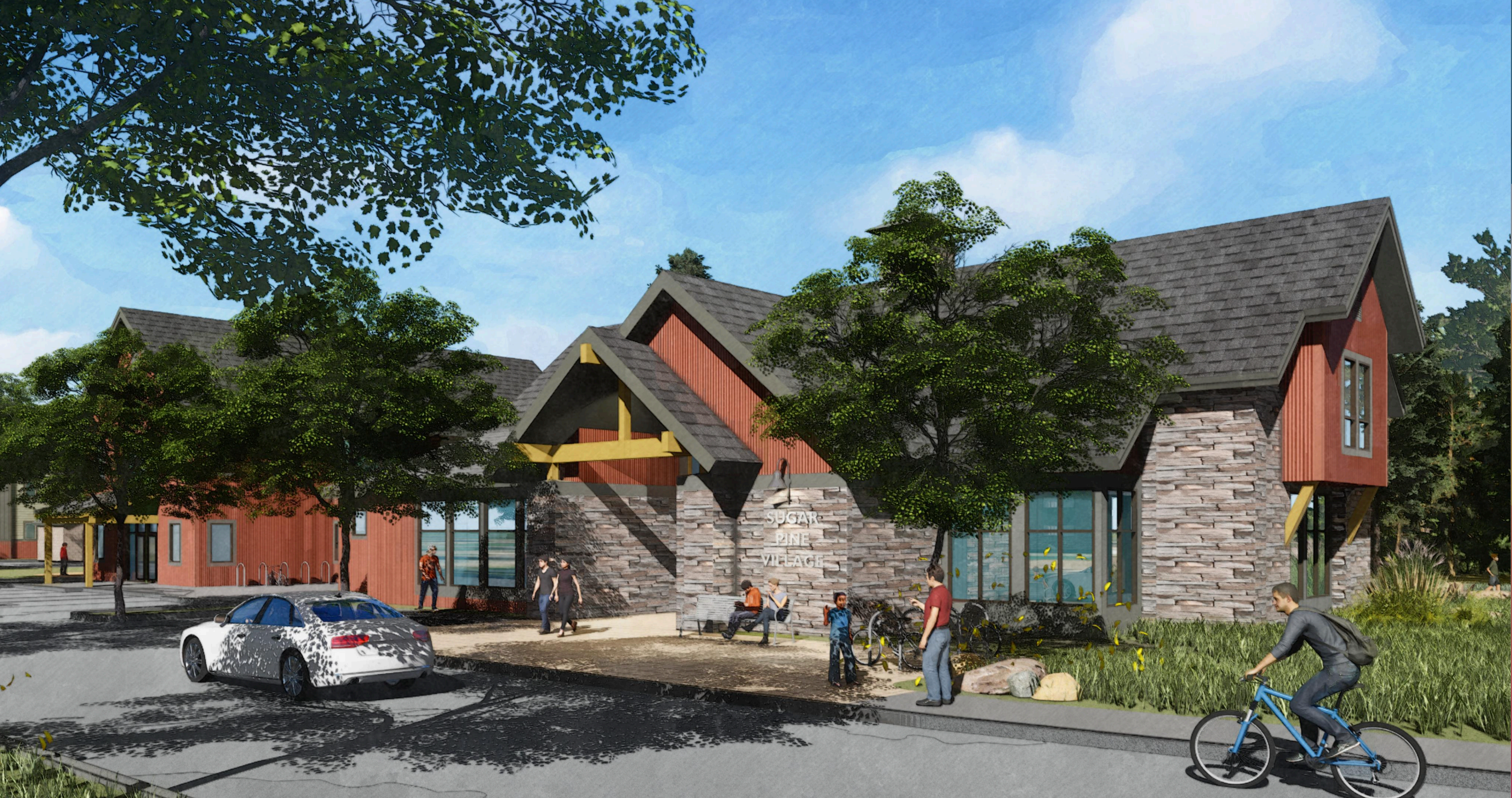
Village Hub & Community Center