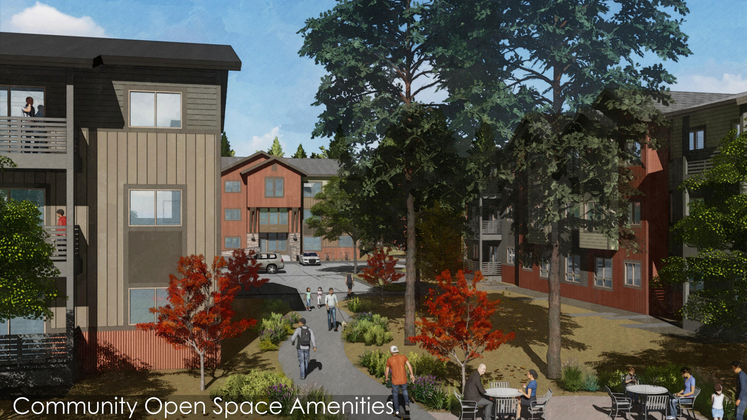
Community Open Space Amenities.